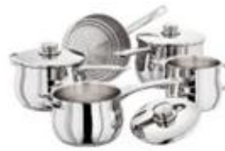
S1F5B Stellar Classic 5 Piece Set