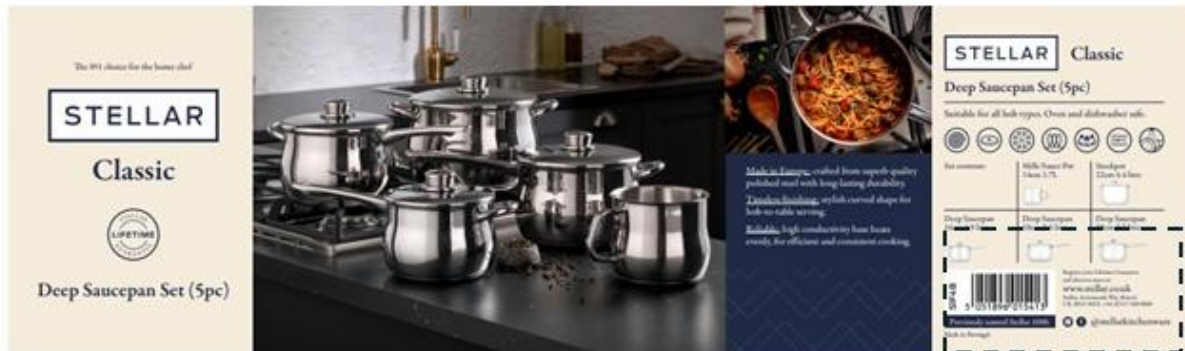
Example of packaging label showing location of product code.

Batch codes can be found printed on the base of each saucepan: