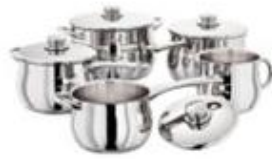
S1F4B Stellar Classic 5 Piece Set